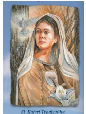
St. Kateri Tekakwitha