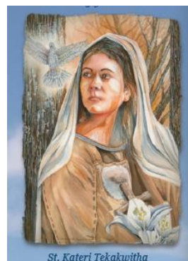
St. Kateri Tekakwitha