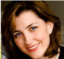
Colleen Carroll Campbell