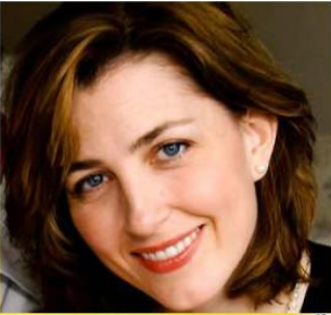
Colleen Carroll Campbell